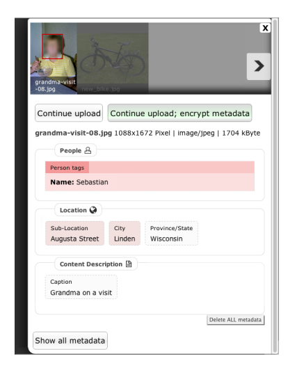
Fig. 2. Upload sidebar allows modification before final submission